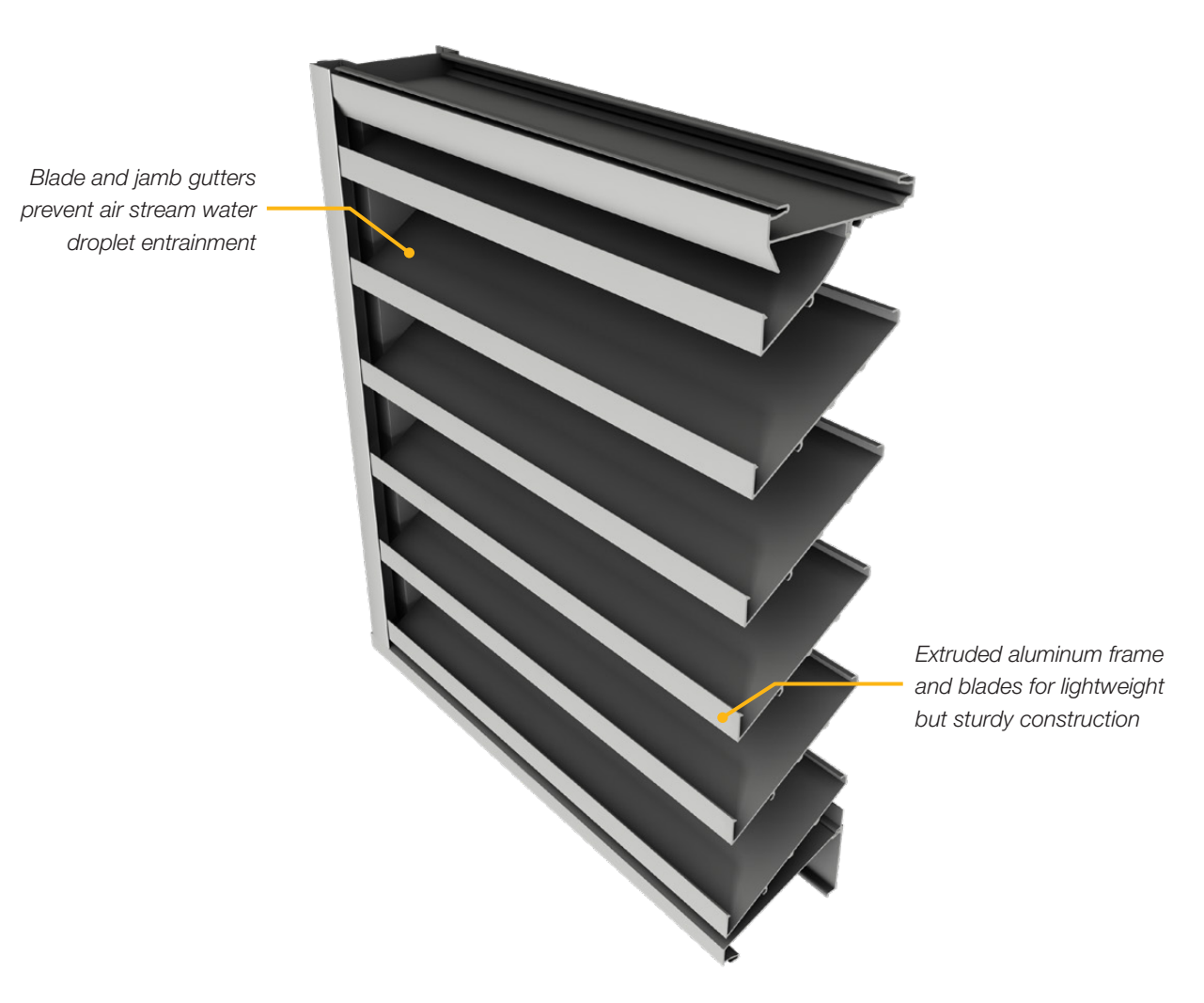
DE635 6" Deep, 35° Fixed Blade Extruded Drainable Louver